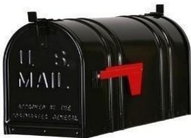
Standard Rural Model U.S. W5" x H6" x D18 1/2" No. T-1 mailbox (Metal or Plastic)

All mailboxes must be maintained in good working condition. Numbers will be replaced when they are peeling or looking faded, and the mailbox will be repainted when the paint is faded or rusting. Posts will be repainted when the color is faded or when the paint is cracking, bubbling, or stained. Posts that are leaning will need to be straightened and secured. Posts that are falling apart or rotting will need to be replaced. If the mailbox post has plants around it, the plants may not be taller than the bottom of the mailbox, and the numbers must be visible.